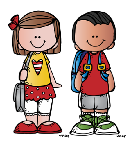
Gilles-Sweet Elementary School

4320 West 220<sup>th</sup> Street Fairview Park, Ohio 44126